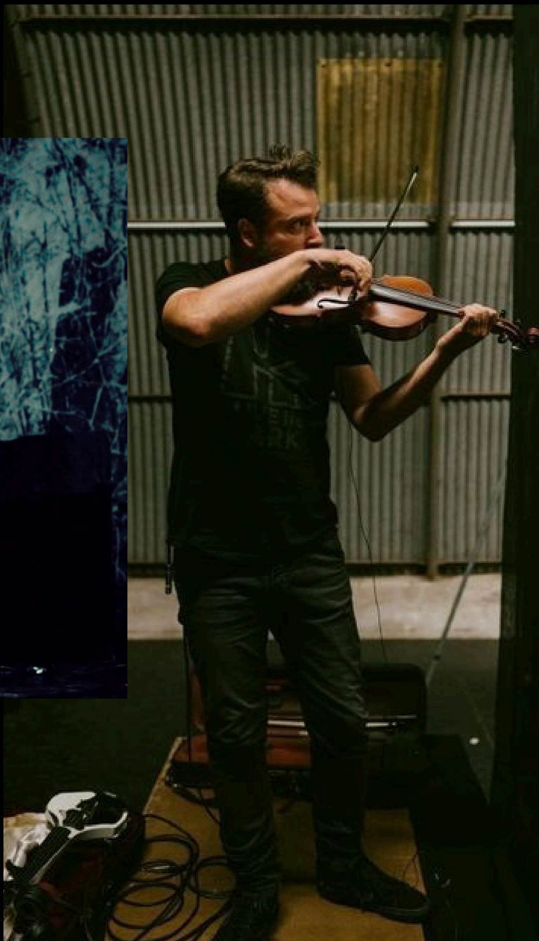
JEDEM DAS SEINE, TITO / VERTIGINI, Spazio Hangar 11, Belluno 2022 [organised by SlowMachine]